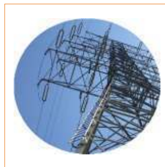
Clean Energy and Power Systems