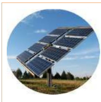
Solar Power Systems