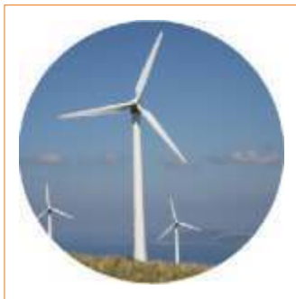
Wind Power Projects & Engineering